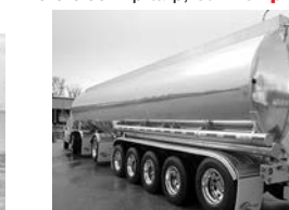
'24 LBT, 13,400-gal., 5-compt., all air, (3) lifts, S.S. frame, disc brakes, pol. barrel, alum. whls., MANY EXTRAS, call for details.