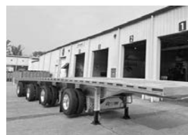
'24 Extreme 50' x 102" quad axle trlr., 14" coil well, air ride susp., (2) lift axles, alum. whls., call for price.