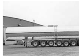
'24 MAC LTT 8-axle 12,000-gal. milk FPU, all air ride, lease to own $248,000 incl. F.E.T.