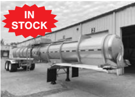
'24 Wabash 3500-gal. DOT 407 straight round trailer, tdm. Intraax air ride susp., in stock.