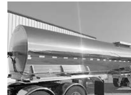
'24 Wabash tri-axle food grade trlr., 7250-gal., air ride Intraax susp., alum. rims, call for price.