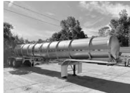
'25 Polar, dbl. conical fert. trlr., 5600-gal., tdm. axle, alum. whls., call for price.