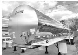
'24 Walker 6200-gal., S.S., air ride, alum. whls., call for price.

Toll Free: 855-ASE-TANK www.ASEtanks.com