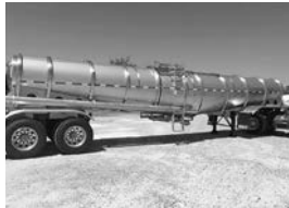
'25 Bulk 5600-gal. fert. trlr., 13 pound product 30" drop, Intraax susp., call for price.