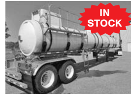
(2) '25 Brenner FRP 5400-gal. trlr., DOT 412, stainless frame, air ride, call for price.