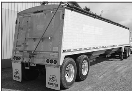
'99 Wilson 40'x96"x66" alum. whls., air ride . . . . . $16,900