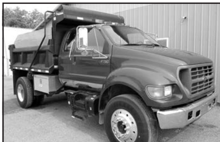
'00 Ford F750, only 55,000 miles! Cat 3126, Allison auto., ext. cab, 10' dump, nice!..... ..... $49,500