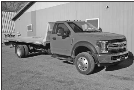
'19 Ford F550 XLT, 6.7L Powerstroke, auto., pwr. windows & locks, 19' Danco Grizzly rollback, 1-owner, only 42,000 miles! ..... $79,900