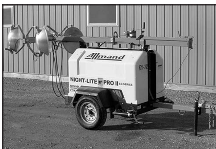
1250 Watt SHO-HD metal halide lights, outriggers, liq. cooled Kubota 3 cyl. dsl., w/glow plugs, 8187 hrs., 35 amp breaker, 120v outlet, 175/80x13 tires, 30-gal. fuel tank w/65 hr. run time . . $3,850