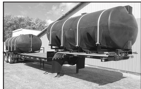
'25 Neville 42' tank trlr., H.D. spg. susp., alum. whls., closed tdm., twin Norwesco 3210-gal. tanks, alum. frt. fenders, LED lights, COMING IN! ..... Call!