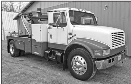
'84 Int'l. S1955, 134,000 miles, DT466, 210 hp, 13 spd., alum. whls., repainted & rblt. motor, LED lights, 90% rubber, stored inside, immaculate!! ..... $32,900