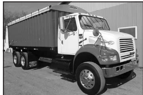
'99 Int'l. 8100, Cum. ISM 330, 330 hp, Rockwell 10 spd., (10) new tires, alum. whls., Hend. walking beam susp., 20' stakeless bed, Shur-Lok tarp, sharp!! ..... $59,500