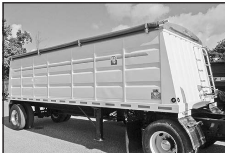
'15 Neville, 24' 710-bu. cap., 11R22.5 tires, roll tarp, alum. whls. . . . . $16,960