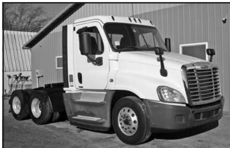
'18 FTL Cascadia 125, 521,000 miles, 450 hp, DD13, 10 spd., 2.53 ratio, NEW tires! Nice! ..... $37,900

Email us at: howard@hgviolet.com Much more inventory in stock. Visit our website for a complete listing.