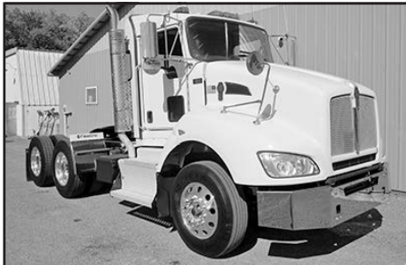
Choice of KW T440 , '14, '15 & '16 model years, ~400,000 miles, Eaton Ultrashift +, 4.33 ratio, 345/370 hp Paccar, nice!! ..... Starting at $58,900