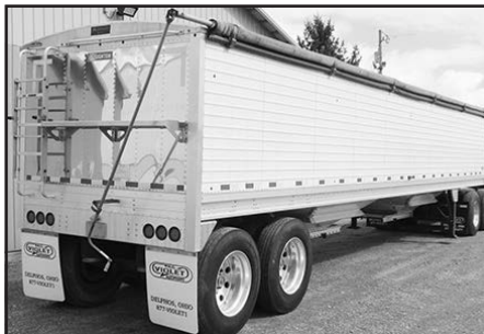
'14 Stoughton 40'x96"x66", Holland landing gear, alum. whls., LED lights, S.S. frt. & rear, Shurco Platinum Series roll tarp, air ride w/ dump, new cond. . . . . $31,900