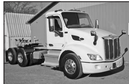
'21 Pete 579, Paccar MX13, 455 hp, 12 spd. auto., all new virgin tires!! ..... $89,500