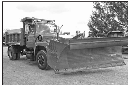
'96 Ford L8000, 89,684 miles, Cum. 8.3L, Allison auto., 10' steel dump, snowplow, Township owned, nice!! ..... $28,900