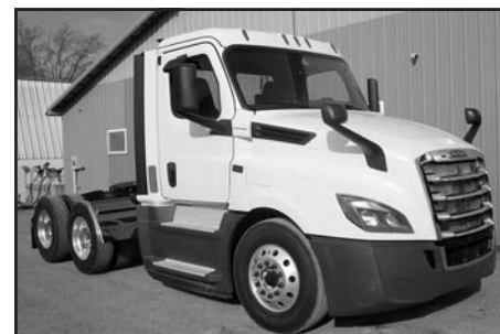
'19 FTL Cascadia, DD13, 450 hp, 12 spd. auto., 2.41 ratio, alum. whls., air ride, nice! . . . . . $46,900