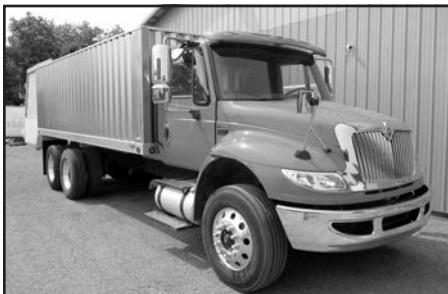
'13 Int'l. 4400, 165,000 miles, 270 hp, DT466, 5.29 ratio, Allison RDS auto., NEW 20' KANN grain bed, tarp, nice!! ..... $124,900

Email us at: howard@hgviolet.com Much more inventory in stock. Visit our website for a complete listing.