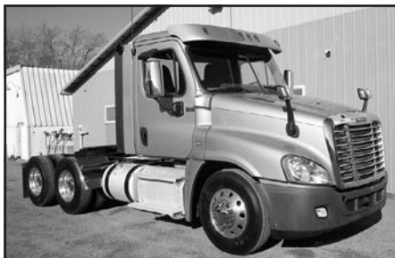
'20 FTL Cascadia 125, 806,000 miles, 450 hp, DD13, DT12 auto., 2.47 ratio, (10) NEW Firestone 11R22.5, very clean! Fleet maintenance!..... $39,900