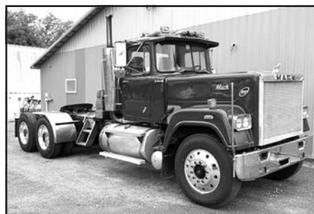
'88 Mack RW600 Superliner, Mack 237 eng., 9 spd., air ride, dual line wet kit, 11R24.5 new Firestone 663 rears, (6) pol. alum. rims, no cab rust, runs & drives great!! . . $28,500