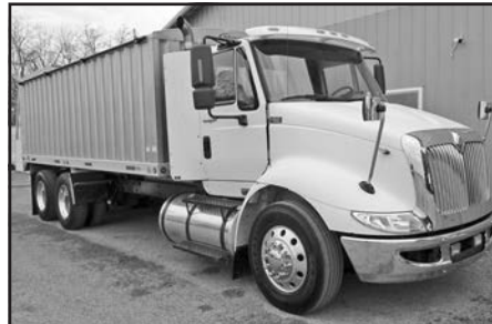
'09 Int'l. 8600, Cat C13, 10 spd., air ride, 20' Dakota alum. bed, local trade, like new! ..... $89,500