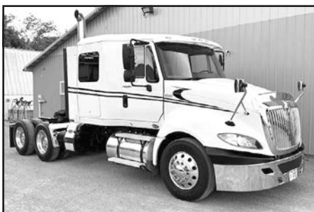
'12 Int'l. Prostar, MF13, 450 hp, 10 spd., 3.42 ratio, 51" flat top, many updates! ..... $49,900