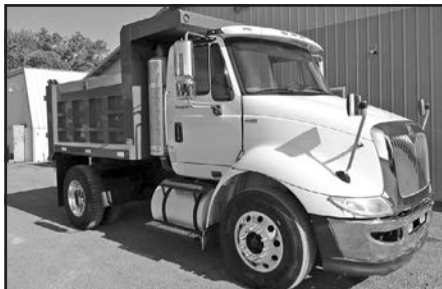
'12 Int'l. 8600, 200,000 miles, 410 hp, 3.42 ratio, 10 spd., 10' steel dump, pintle hitch, alum. whls..... $62,900