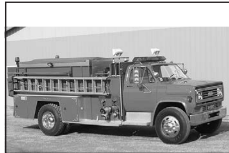
'85 Chevy C70, beautiful example of an old, clean community fire truck, 24,116 miles, 5" suction hose, float & barrel strainer, 1000-gal. FMC tank, 5000W elec. start, gas powered generator, very clean, well taken care of fire truck. $9,500