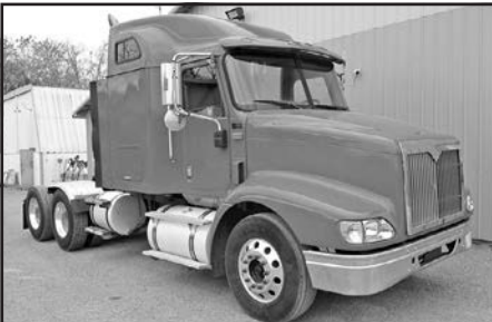
'03 Int'l. 9200, Cum. ISX, 435 hp, 10 spd., 3.73 ratio, 51" mid-roof, recent o'haul, new paint, local farmer owned, PRE-EMISSION!... ..... $29,500