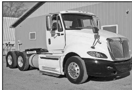
'15 Int'l. Prostar, 477,000 miles, N13, 450 hp, 10 spd., 3.70 ratio, air ride, nice! ..... $39,900