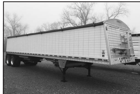
'12 Wilson, Shurco roll tarp, air ride w/manual gauge, S.S. frt. & rear, high arch end caps & bows. . . . . $29,900