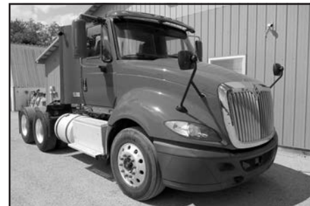
'16 Int'l. Prostar, 338,000 miles, 450 hp, 10 spd., 3.42 ratio, air ride, alum. whls. .... $64,900