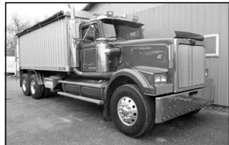
'96 Western Star 4900 grain truck, Det. Dsl., 430 hp, 13 spd., air ride, 18' stakeless steel grain body/hoist, new virgin tires, alum. whls., show truck!!..... $59,500