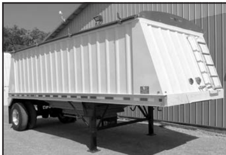
'24 Neville 24', alum. hopper, alum. whls., LED lights, JUST IN!!! ..... CALL!!