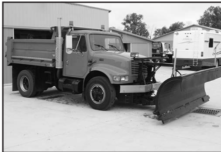
'94 Int'l. 4900, nice red paint, 148,000 miles, htd. mirrors, auto. trans., 11' snow blade, Pengwyn elec. controls. . . . . $27,900