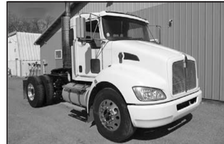
'09 KW T370, Paccar PX8, Allison 3000 HS auto., (6) new tires, alum. whls., local truck. . . . . $43,900