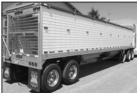
'16 Timpte, 40'x96"x72" (2) ag hoppers, 11R22.5, alum. whls., roll tarp, air ride, S.S. rear, (2) rows of (9) LED lights per side . . . $35,900