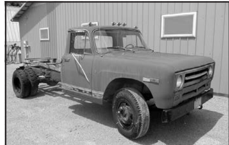
'69 Int'l. 1500D C&C, 345 V8, 4/2 spd., owned by former Int'l. dealer, very straight, does not run ..... $6,850