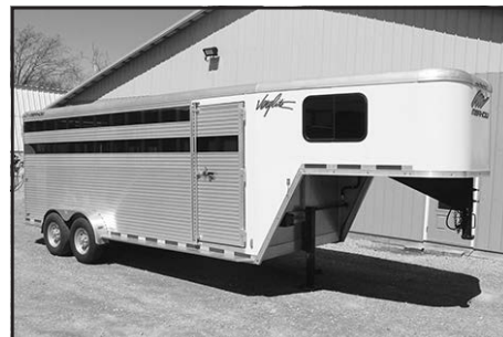
'08 Merhow, 20' alum. livestock trlr. in like new cond. . . . . $14,900