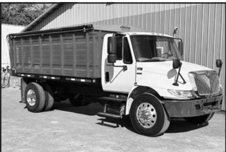
'09 Durastar 4300, 274,000 miles, DT466, 225 hp, EF 6 spd. auto., 16' Parkhurst steel bed, Harsh hoist, triple doors, Agri-Cover tarp, alum. whls., D.O.T. inspected, new main drive clutch/pressure plate ..... $49,900