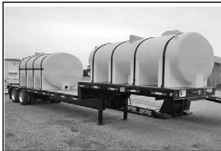
'18 Neville nurse trlr., 38'x102" Apitong floor, alum./steel whls., 13' upper deck, 2350-gal. tank on top deck, 3250-gal. tank set 52" from rear of trlr., LED lights, spg. susp. . . . . Call

Email us at: sales@hgviolet.com Much more inventory in stock. Visit our website for a complete listing.