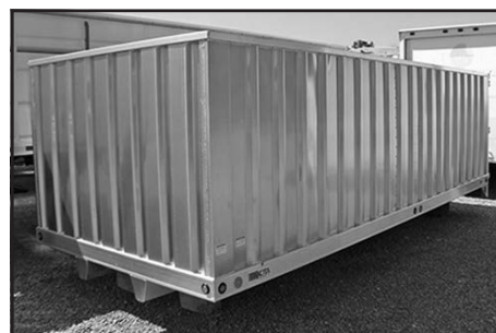
New Dakota 20' grain body, 96" wide, 62" sides, (3) piece rear door, LED lights, 640-bu. cap. . . . . Call for price & availability