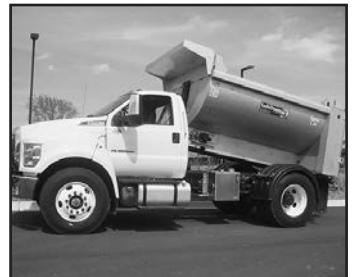
'17 Ford F750 , dsl., auto., 10' S.S. combination dump body spreader.