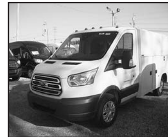
'17 Ford Transit Knapheide KUV service truck, call for special price.