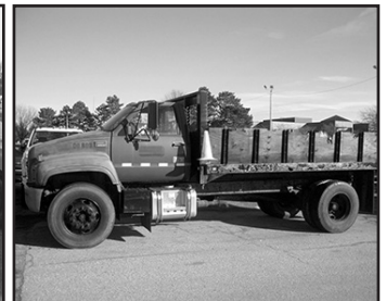
'00 GMC C6500 flatbed, low miles, only $8,900.