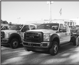
'16 & '17 Ford F550 , 4x2, 4x4, l., auto., C&C for 11' or 12' beds, in stock.