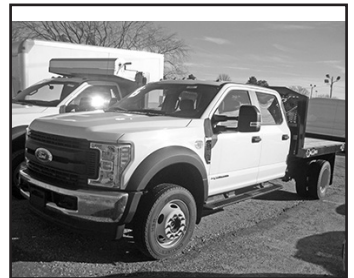
'17 Ford F450 crew cab , 4x4, 9' Wood flatbed in stock.