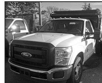
'11 Ford F350, dsl., 11' dump, priced right at $19,600.