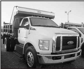
New Ford F650 dump , 6.7 dsl., auto., 6/7 yd. steel, tarp, hyd. to rear for salt spreader, 26,000 GVW, under CDL.

Are You Ready For Spring? WE ARE - Work Trucks In Stock.