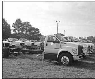
'16 & '17 Ford F650 & F750, gas & dsl., now in stock, will build for your needs.