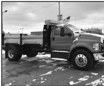
'17 Ford F650 , dsl., 14' flatbed dump w/alum. drop down sides.