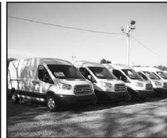
Great selection of '16 & '17 Ford Transit vans, LWB & high roof, all sizes in stock.