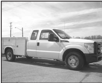
'12 Ford F250, 6.2 V8, auto., 79,800 miles, utility body, $17,900.