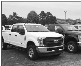
Good selection of '17 pickups to choose from.