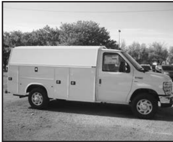
'17 Ford Knapheide KUV service truck, call for special rebates & price.