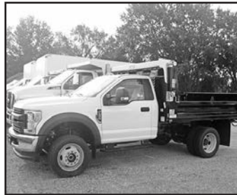
'17 Ford F550, 9' steel Voth dump box, tarp, hitch, ready to go.