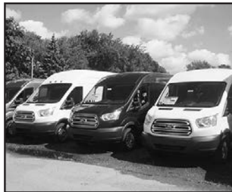
All-new '16 & '17 Ford Transit vans , LWB, mid-roof, 3.7 gas, auto., SEE IT NOW!