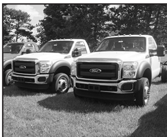
Many '16 & '17 C&C in stock.