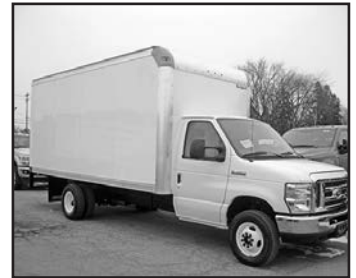
'17 Ford E350, 6.2 gas, 15'x7' alum. van body, (2) incoming.