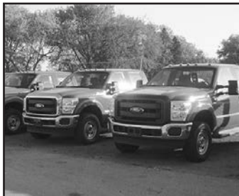
Great selection of '17 F250 & F350 Super Duty's , in stock, choose your favorite.