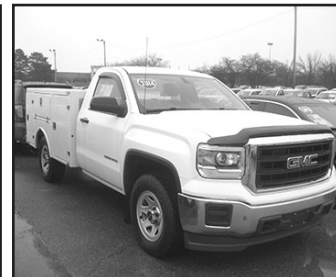
'14 GMC 1500, composite service body, only 36,000 miles, $26,900.