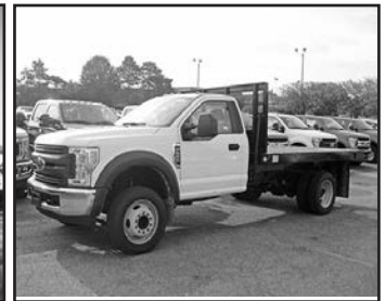
'17 Ford F550, 4x4, dsl., 12' flatbed, ready to go!