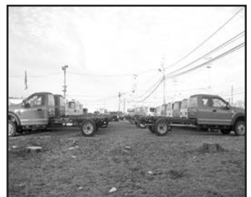
Over (40) C&C in stock! Many cab styles & wheel-bases to choose from!