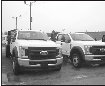
'17 & '18 Ford F550 crew cab chassis, some w/flatbeds, 9' & 12', good selection.