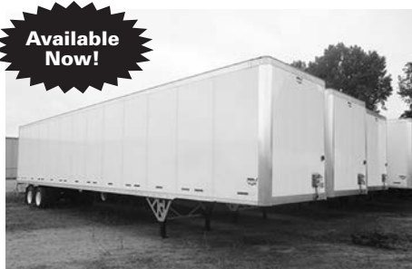
'18 Wabash Duraplate , 50" LP, full galvanized rear, alum. roof, Goodyear tires, Hend. HKANT 40 air susp., PSI.