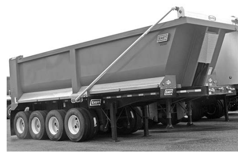
New '18 East AR450 quad axles , high liftgates, 102" wide chassis.