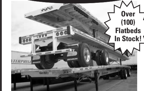
New all alum. Benson/Transcraft flatbeds , 48' & 53' rear sliding axle.