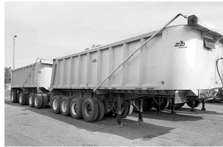
'98 Benson super train , elec. tarp, liners.