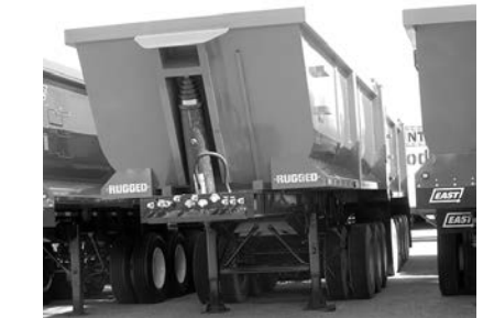
Frue. frame w/new rugged AR450 steel bodies.