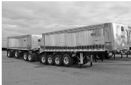
(2) '17 East super trains , in stock, Genesis alum. frame, air ride.