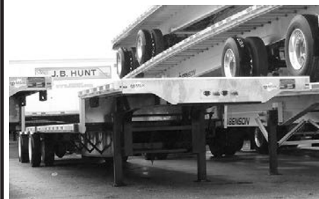
New Transcraft 53' drop deck , Eagle 1, rear slide.