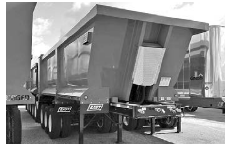
'17 East AR450 steel Michigan train.