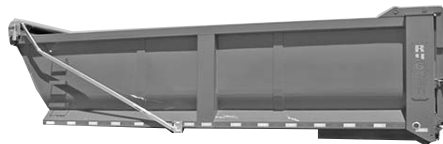
Rugged truck & trailer bodies , 12'-30' quarter round bodies, AR 450 virgin steel, dual acting high lift tailgate.