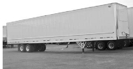
New Wabash 53' flat floor log. post reefers , tire inflation. Duct floor also avail.