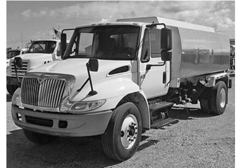
'05 Int'l. 4400, DT466, auto., 33,000 GVW, S/A, alum. tank.