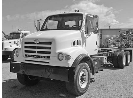
'01 Sterling 7501, 3126 Cat, 275 hp, auto., RT46160, 6.43 ratio, 18F, twin steer, Hend. walking beam, low miles, 246" WB.