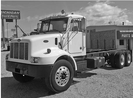
'05 Pete 330 C&C, ISC 315 hp, RTLO11610B, Eaton DSP41 rears, 4.33 ratio, 245" WB, 52,000 GVW.