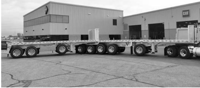
New Reitnauer B-train & 8-axle coming soon.