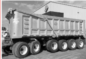
'98 MAC 6-axle pup , 26', (1) lift, push bumper, elec. tarp, poly liner.