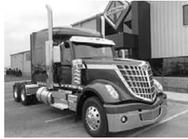
'22 Lonestar , X15-565, 18 spd., 13.2F, 40R, 3.70 ratio, ADB, dual exhaust & breathers, inverter, bunk heater, dual 140-gal., Diamond trim, D-Brites, 135,000 miles, SHARP!!