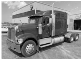
'06 Int'l. 9900i ISX , 500 hp, 13 spd., 12F, 40R, 3.90 ratio, 244" WB, 72" splr.