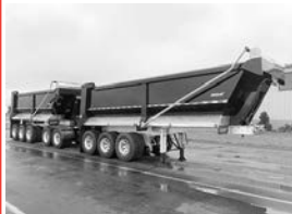
Stargate demo triple 10 , alum. frame, AR450, hi-lift gates, 60" sides, (2) lifts, Aeros elec. tarps, push bumper.