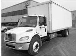
'16 FTL M2 , Cum., Allison, air ride, 26,000 GVW, air brakes, 26' van w/walk ramps.