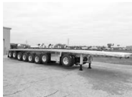
Reitnauer 50' 8-axle , pol. alum. whls., disc brakes, Michelin, (4) lifts, tool box, COMING SOON!