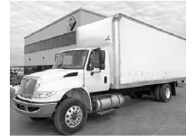
'15 Int'l. 4300 , Cum., Allison 2500 RDS, 33,000 GVW, air ride, 26'x102"x109" van body, 319,000 miles, lease maintained.