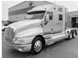
'11 KW T2000 , C13, 485 hp, 13 spd., 12F, 40R, 3.55 ratio, wet kit, new virgin drives.