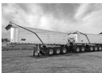
Stargate alum. triple 10 , alum. frame, 96" wide, 60" sides, liners, Roll-Rite elec. tarps, push bumper.