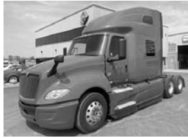
(3) '22 LT625 , Cum., 12 spd. automated, disc brakes, inverter, bunk heater, collision avoid., (10) new tires, 2 yr./200,000 eng. warranty, miles low as 132,000.