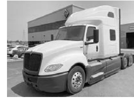
'21 LT625 , Cum. X15-450, automated trans., 73" skyrise, ADB, no-idle system, collision avoid, Flow Below, 247,000 miles.