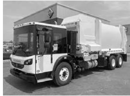
New Dennis Eagle chassis , Cum. I9-360, Allison, 20F, 44R, lockers, HN460 susp., 230" WB, New Way 31-yd. automated Sidewinder.