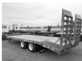
BWS 20-ton tag , 20' deck, 34" deck ht., (4) pr. D-rings, air ramps, red or black.