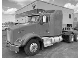
'07 KW T800 , C15-475, 18 spd., 14F, 46R, lockers, air ride, 4.10 ratio, 220" WB 60" Aero, fresh trans. & clutch, 130,000 on Cat o'haul, wet kit.