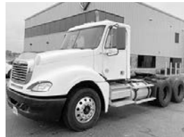
'09 FTL CL120 , 455 Det., 10 spd., air ride, 12F, 40R, 3.73 ratio, 372,000 miles.