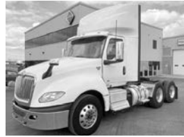
'19 Int'l. LT , A26-450, 10 spd. auto., 177" WB, dual 80-gal., 140,000 miles, lease maintained, remaining warranty.