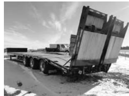
BWS 53' paving & recovery , air ride, 11' bi-fold air ramps, add'l. air ramps to gooseneck, lift axle, pol. alum. whls., very versatile trlr.!