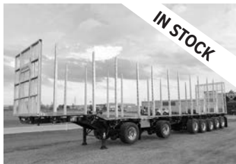
New Deloupe loggers in stock , 7 & 8-axle, (6) bunk, galv. stakes & bulkheads, 445/50R22.5, high payload cap., top quality.