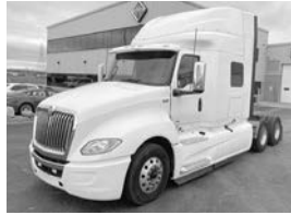
'20 Int'l. LT , A26-450, 12 spd. auto., disc brakes, bunk heater, 73" hi-rise, 84,000 miles, lease maintained, remaining warranty.