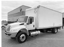
(2) '19 MV607 , Cum., Allison RDSP, air ride, 100-gal. fuel, 24'x102"x103" van, 3000 lb. liftgate, 26,000 GVW @ 110,000 miles, 33,000 GVW @ 71,000 miles.