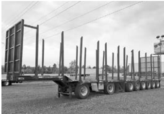
'16 Express 8-axle log trlr. , 53', 6-bunk, air ride, (4) lifts, 445s on 2 spreads.