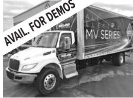
New '23 eMV , fully electric truck! Air ride, 26'x102"x103" van, 3000 lb. liftgate, pwr. locks, windows & mirrors, LED headlights, tilt, nicely equipped. Avail. for demos!