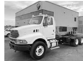
'06 Sterling , Series 60, 13 spd., 14.6F, 46R, air ride, 212" WB, lockers, dbl. frame, 17' of frame.