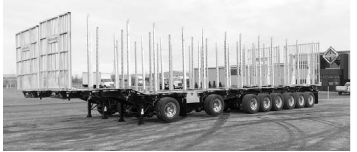
7 & 8-Axles currently in stock, 53', (6) bunk.