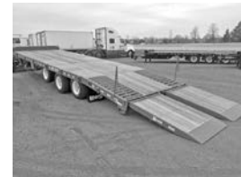
BWS 25-ton tag , 24' deck, (4) bag tilt, air ramps, lift axles, (8) pr. D-rings, various specs in stock, red or black. Also: 30-ton, non-tilt, air ramps.

See all pictures & additional information @ www.wielandtrucks.com