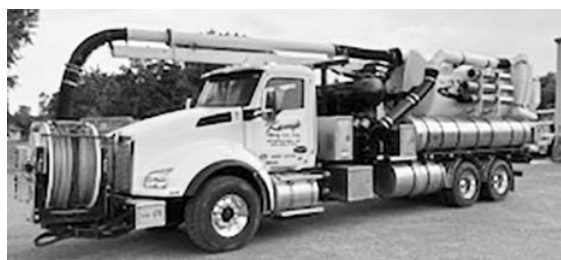
'18 KW T880, Cum. eng., 10 spd. trans., Roots 824 RCS positive displacement blower, 18" vacuum, 15-yd. debris body, like new, $380,000.