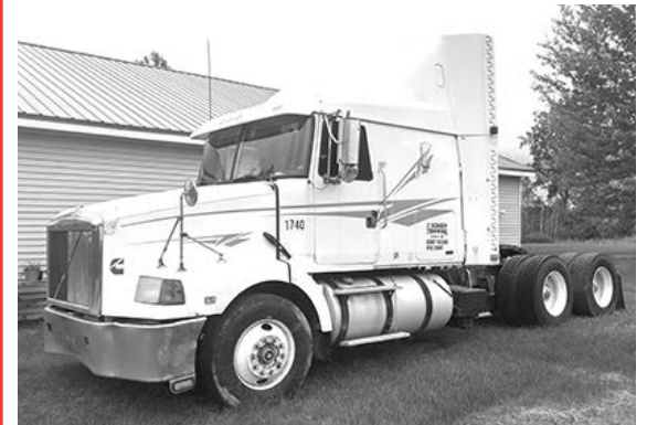
'94 Volvo, 60" dbl. bunk, 435 N14, 9 spd., 300,000 on rebuild, newer clutch, drive-shaft, brakes, tires, air bags, oil samples, spare parts to go with, $15,000.