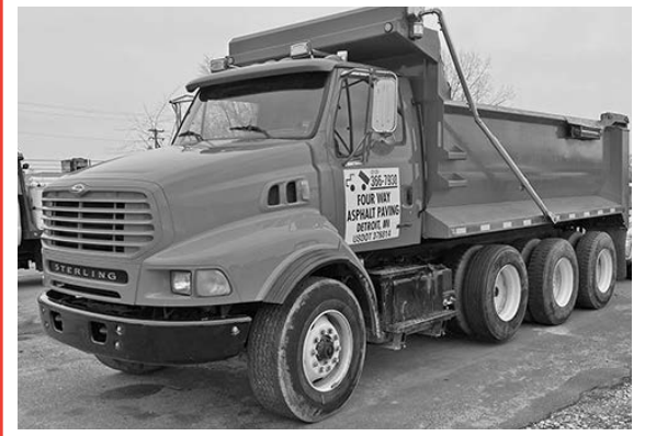
'01 Sterling tri-axle Roc-Box w/high lift tailgate, low mileage, Cum. 339 hp, factory rblt., sell or trade. (313) 806-1800

'15 Bobcat E32, hyd. thumb, 19" bucket, 80% U/C, low hrs., $35,000 '13 Deere 50D, ROPS, new tracks, 4-way blade, $38,500 '18 Bobcat S570, cab, 2 spd., hi-flo, $32,500 '19 Cat 279D, A/C, new tracks, 79" bucket, 775 hrs., $70,000 '18 Cat 249D, cab, 80%+ tracks, back-up camera, $42,500 '04 Deere 310SG CX4, 100% frt. tires, 50% rear tires, $32,500 '97 Deere 410E CX4, 24" rear bucket, $28,500 '06 Deere 310G CX4, A/C, rear aux., 100% frt. tires, 50% tires, $38,500 '05 Deere 310G CX4, 18" bucket, low hrs., new rear tires, $38,500 '06 Case 580SM II CX4, A/C, aux. hyd., low hrs., $40,500 '04 Case 580SM Plus CX4, A/C, pilot, $38,500 '13 Skytrak 10054, solid tires, $45,000 '07 Skytrak 6042, foam filled tires, wide carriage, $38,500 '17 Kubota B26T/L/B, 4x4, $28,000 '18 Kubota BX23S, $19,500 '17 Kubota BX23S, $18,500 Mid Michigan Services Company, Inc. 8458 Torrey Rd. Grand Blanc, MI 48439 (810) 655-2025 or Mobile (810) 348-4089 E-mail: mmsci@comcast.net Web: www.mid-michiganequip.com