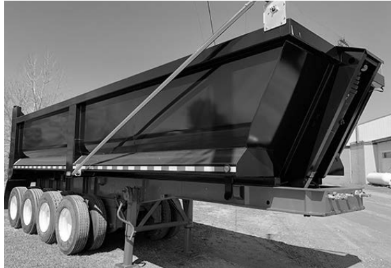
Quad 28' rock boxes, call for availability. Prices range from $40,000 to $50,000. Normally will have new tires, brakes, box, hoist, paint, lighting, & rear pin on hub-piloted rims.