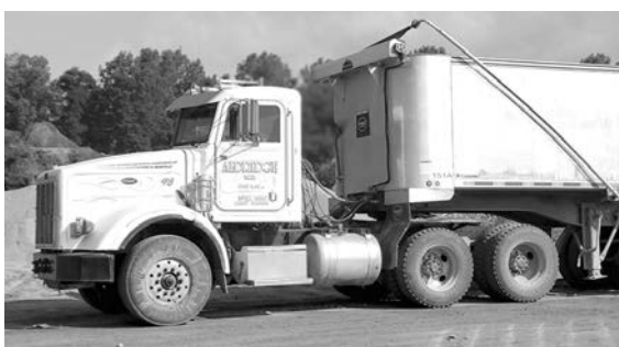
'04 Pete Michigan Special, 18F, 46R, 3406 Cat, 18 spd., good tires, ready to work, $37,000.