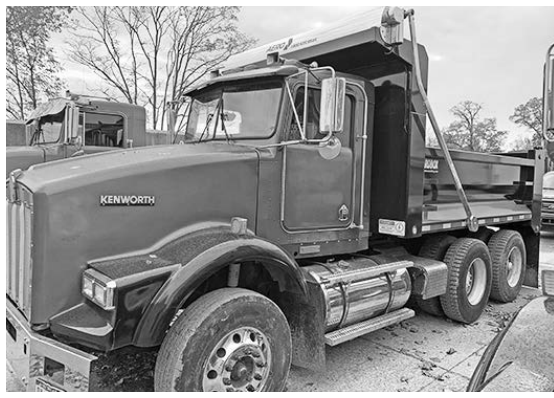
'94 KW dump truck, brand new box, 10-yd. box, never used, Cum. motor, $48,000 or best offer. (734) 485-1740