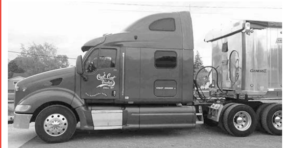
'05 Pete 387, C15 Cat, 18 spd., hydro kit, 1.2 million on chassis, 300,000 on rebuild, 3.73 ratio, new radiator, turbo & drives, $37,500 or best offer, open to all offers. (989) 450-9417