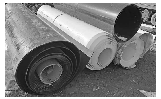
WE ARE A MOUNTAIN TARP DEALER All tarping needs are avail. Call for details & fall pricing.