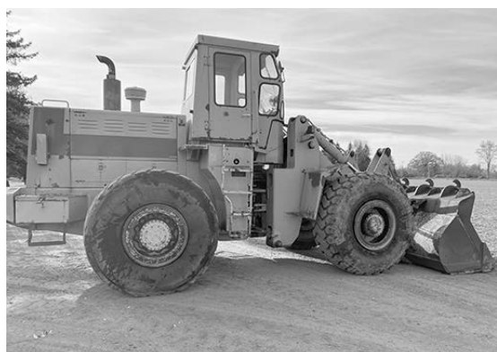
Kobelco LK700 whl. ldr., $24,900, call for more info. (586) 727-6065

WANTED 28' or longer dump trlr. frames, 95' or newer or repairables. (989) 550-0644