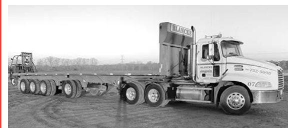
'07 Mack CXN613, E7-460, 460 hp, 18 spd., 14.6F, 46R, 163" WB, 4-way lockers, 22.5 rubber, 4.11 ratio, alum. whls., eng. rblt. by Mack dealer at 505,000 miles, truck has less than 600,000 miles now '97 Utility 45' flatbed trlr., alum. whls., frt. 9' spread & rear & frt. axle lift independently, very low mileage trlr. in like new cond., '89 Princeton forklift, Deutz dsl. One-owner, retiring, $69,500 for pkg. (586) 531-2012