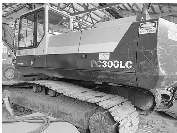
Komatsu PC300-5, fresh finals, plumbed 2, 10,000 hrs., $59,000, call for more info. (586) 727-6065