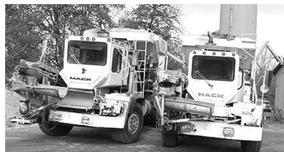
(2) Elkin frt. discharge mobile mixers, quad-axle, good running mixers, (1) silo, call for new pricing. (517) 410-4874