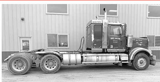
'07 Western Star, C15 Cat, 18 spd., wet kit, 75-gal. oil tank, $30,000. (517) 719-7437