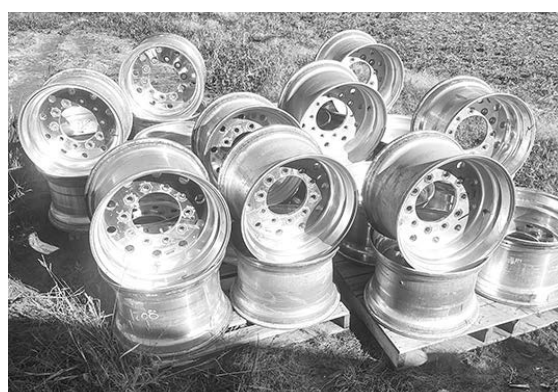
Accuride 22.5x14 alum. w/0.5 outset for super single tires, lg. quantity avail.