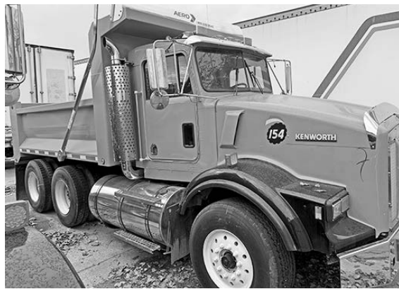
'98 KW dump truck, brand new box, 10-yd. box, never used, Cum. motor, $48,000 or best offer. (734) 485-1740