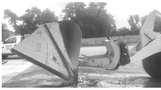
Finning high tip bucket w/JRB 416 quick attach coupler, $12,000.