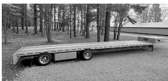
'18 Wilson 53' combo step deck, bought in '19, exc. cond., 90% on tires & brakes, used very little, fixed spread, $39,000. (989) 708-5439