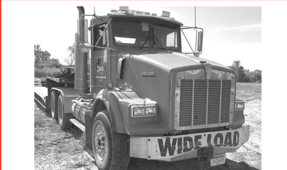
'00 KWT800 Michigan Special, Cum. N14, 460 hp, 360,000 low miles, 13 spd., 46R, 4.10 ratio, well cared O/O ran, $35,000.