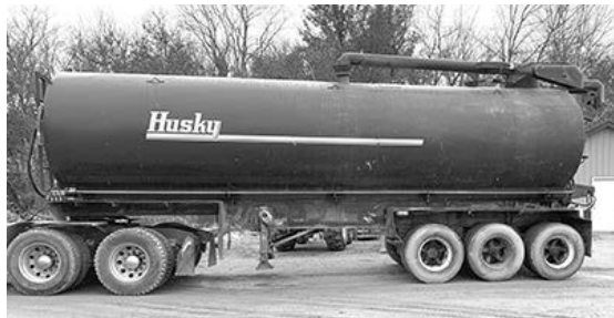
Husky manure tanker, 9000-gal., field spread boom kit 8" Elsie, MI (517) 719-7437

'15 Bobcat E32, hyd. thumb, 19" bucket, 80% U/C, low hrs., $35,000 '13 Deere 50D, ROPS, new tracks, 4-way blade, $38,500 '18 Bobcat S570, cab, 2 spd., hi-flo, $32,500 '19 Cat 279D, A/C, new tracks, 79" bucket, 775 hrs., $70,000 '18 Cat 249D, cab, 80%+ tracks, back-up camera, $42,500 '04 Deere 310SG CX4, 100% frt. tires, 50% rear tires, $32,500 '97 Deere 410E CX4, 24" rear bucket, $28,500 '06 Deere 310G CX4, A/C, rear aux., 100% frt. tires, 50% tires, $38,500 '05 Deere 310G CX4, 18" bucket, low hrs., new rear tires, $38,500 '06 Case 580SM II CX4, A/C, aux. hyd., low hrs., $40,500 '04 Case 580SM Plus CX4, A/C, pilot, $38,500 '13 Skytrak 10054, solid tires, $45,000 '07 Skytrak 6042, foam filled tires, wide carriage, $38,500 '17 Kubota B26T/L/B, 4x4, $28,000 '18 Kubota BX23S, $19,500 '17 Kubota BX23S, $18,500 Mid Michigan Services Company, Inc. 8458 Torrey Rd. Grand Blanc, MI 48439 (810) 655-2025 or Mobile (810) 348-4089 E-mail: mmsci@comcast.net Web: www.mid-michiganequip.com