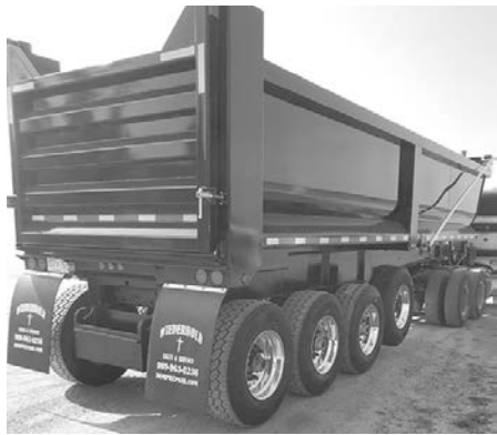
'99 R/S 28' quad-axle rock box, new contract welding rock box, new tarping system, new hoist, new lighting, new rear bushing pin set up, all new tires & alum. rims, new 5th whl. plate, 95% brakes, $49,000.