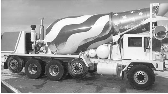
'00-'13 Front discharge mixers, Advance, Kimble, Phoenix & Oshkosh, Cat & Cum. motors.