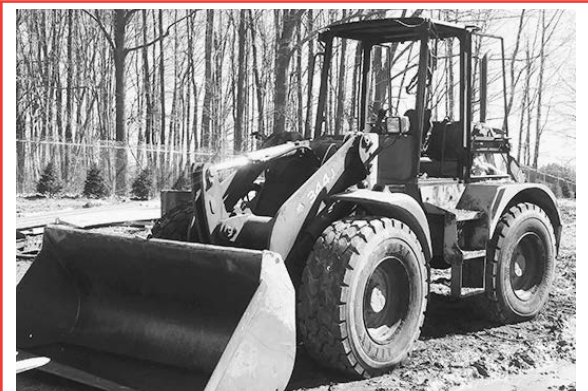
'13 JD 344J ldr., documented 2000 hrs., before machine burned, (4) new foam filled tires, quick attach bucket & forks, orig. owner, $15,000 or best offer. (810) 459-7997

'98 Pete Michigan Special 3-axle tractor, $59,000 160kW generator, 400 hp, 3-phase, rblt. eng., $12,900 Frue. alum. train, $22,900 '00 T/M step deck trlr., 48' long, $9,000 Steel tracks for rubber tire skid steer, $1,500 Call for more info. (586) 727-6065