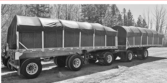
'96 Fontaine combo lead, '97 East alum. pup, 5-axle Hend. air ride susp., exc. brakes & tires, 11R22.5 on alum. whls.