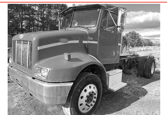
'99 Pete 330, Cat 3126B, RT8908LL, 12F, 21R, $7,900, call for more info. (586) 727-6065