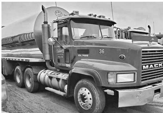
We are selling (6) '07 Mack CL733s, they all have ISX-565 engs., 18 spd. trans., (2) have wet kits installed, $50,000 ea.