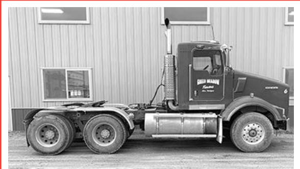
'06 KW, C15 Cat, 13 spd., Michigan Special, wet kit, $60,000. (517) 719-7437