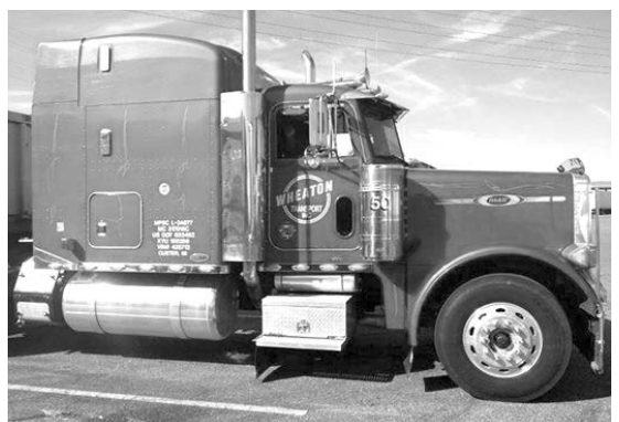
'97 Pete 3406E, factory 550 Cat, pre-emission, 3.55 ratio, 11x22.5 tires, APU, microwave, TV, 200,000 miles since majored at MI Cat, new head, cam shaft, wire harness, eng. sensors, fan clutch, 20,000 miles on turbo, transmission, clutch, pressure plate, pilot bearing, $55,000 or best offer.